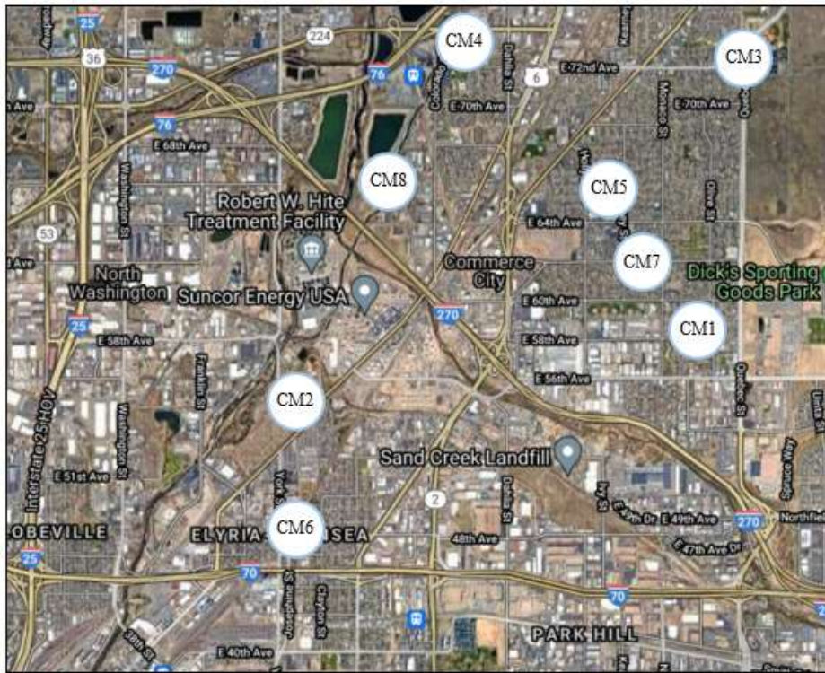
FIGURE 1-1 MAP OF EIGHT CCND MONITOR LOCATIONS